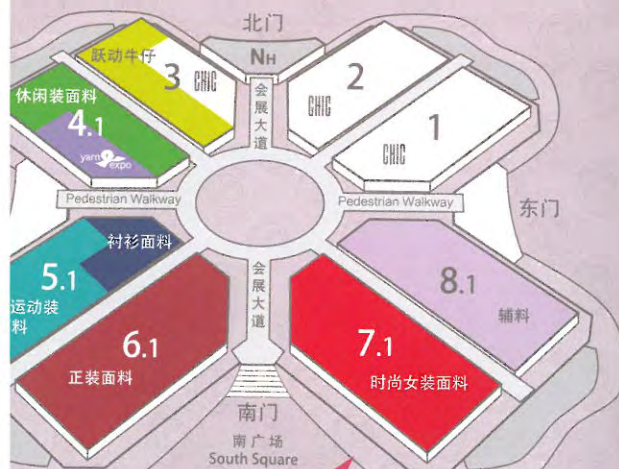
一层 1 st Floor