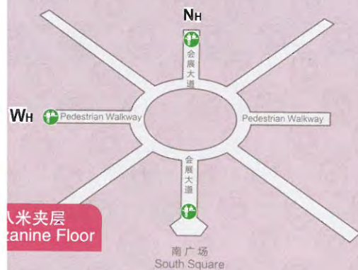
夹层 Mezzanine Floor